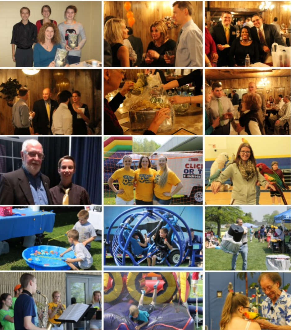
Speakers Series, Gala/Silent Auction, 9/11 Program and Learning Festival