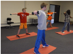
Innovative Projects Grants in Action